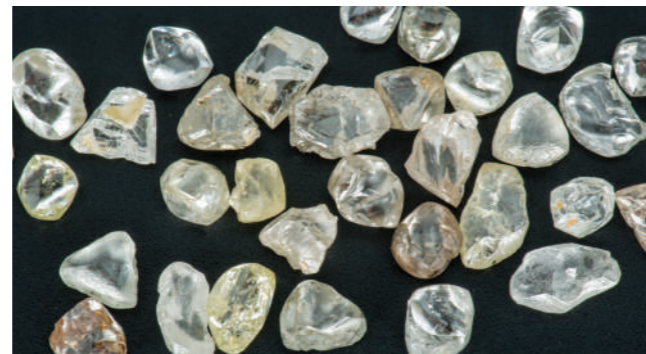
A natural diamond is a gift from the earth. A cutter carefully examines the rough before polishing to a finished gem of optimal beauty.

Following their extended time in residence in the mantle, some diamonds are brought to the earth's surface by volcanic eruptions of kimberlite magma. Geologists believe that the diamonds are transported by the magma very quickly over the 100-mile distance (in just a week or more), so that the diamonds are not physically changed in the process and transformed to graphite. During this rapid upward journey, the diamond crystal can, however, break along cleavage directions, and undergo other changes that may affect, for example, its color.