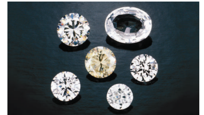
Diamond simulants, from top (left to right): Strontium titanate, synthetic spinel, synthetic rutile, yttrium aluminum garnet (YAG), zirconium oxide (CZ), zircon.

Various materials have been used as imitations or substitutes for diamonds since ancient times. These materials, often referred to as diamond simulants , may grow naturally in the earth or artificially in a lab. Years ago, the colorless varieties of some colored stones (i.e., quartz) were used to simulate diamond. Today, the most common simulants are cubic zirconia (zirconium oxide, or CZ), and to a lesser extent, synthetic moissanite (silicon carbide). Because simulants differ completely from diamond, they display diagnostic properties by which they can be recognized with standard gem testing techniques, observations under magnification and commercially available "diamond testers."